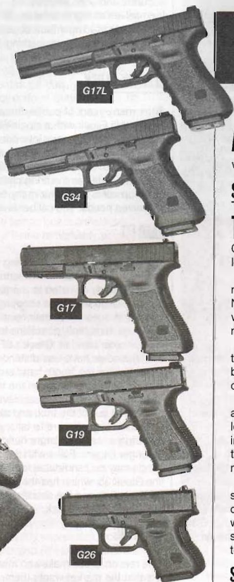
The five configurations of standard size Glocks, shown here in 9mm. From top: longslide G17L, Tactical/Practical G34, standard size G17, compact G19, subcompact "baby Glock" G26.