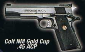
Colt NM Gold Cup .45 ACP