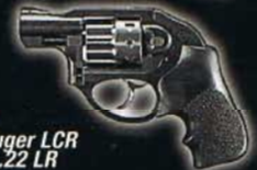
Ruger LCR .22 LR