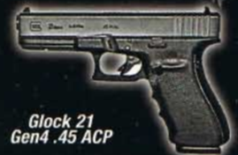
Glock 21 Gen4 .45 ACP

AYOUB'S FAVORITE AUTOPISTOLS & REVOLVERS