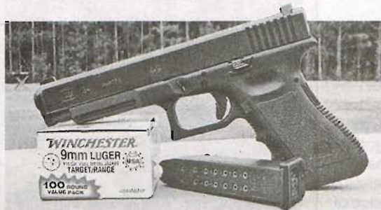
The Glock Tactical/Practical, here in a 9mm G34 configuration.

Glock has been known to produce other calibers for markets outside the United States. The Glock in caliber 9x21 is popular in Italy, where private citizens are forbidden to own military caliber guns. One South American nation reportedly permits its citizens to carry only .32 or smaller caliber handguns; a Glock in .30 Luger would be ideal there. Glock produces compact and subcompact