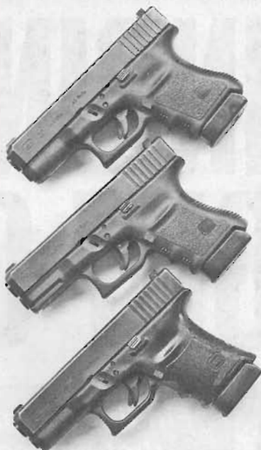
Glock offers different grip options. Among these G30 .45s (starting from the top) we have a standard G30, a G30 SF, and an early G30 with a grip trim from Rick Devoid.

By the turn of the 21st century, Glock had come out with guns in a length between standard and target length, their barrels 5.3 inches long and specifically engineered to fit the “footprint” of maximum sizes mandated for two of America’s most popular action shooting sports. Called the “Tactical/Practical” Glocks, the Glock 34 in 9mm took G17