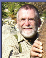
Hornady Manufacturing President

Session Time: Tuesday 7:15 - 8:15 am Conference Room: 204