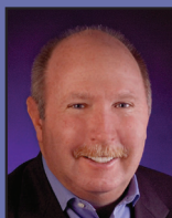
Smith & Wesson Corporation President & CEO

Session Time: Tuesday 7:15 - 8:15 am Conference Room: 202