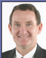
Sturm, Ruger & Co., Inc. President & CEO

Session Time: Tuesday 7:15 - 8:15 am Conference Room: 203