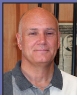
Savage Sports Corporation Chairman & CEO

Session Time: Tuesday 7:15 - 8:15 am Conference Room: 201