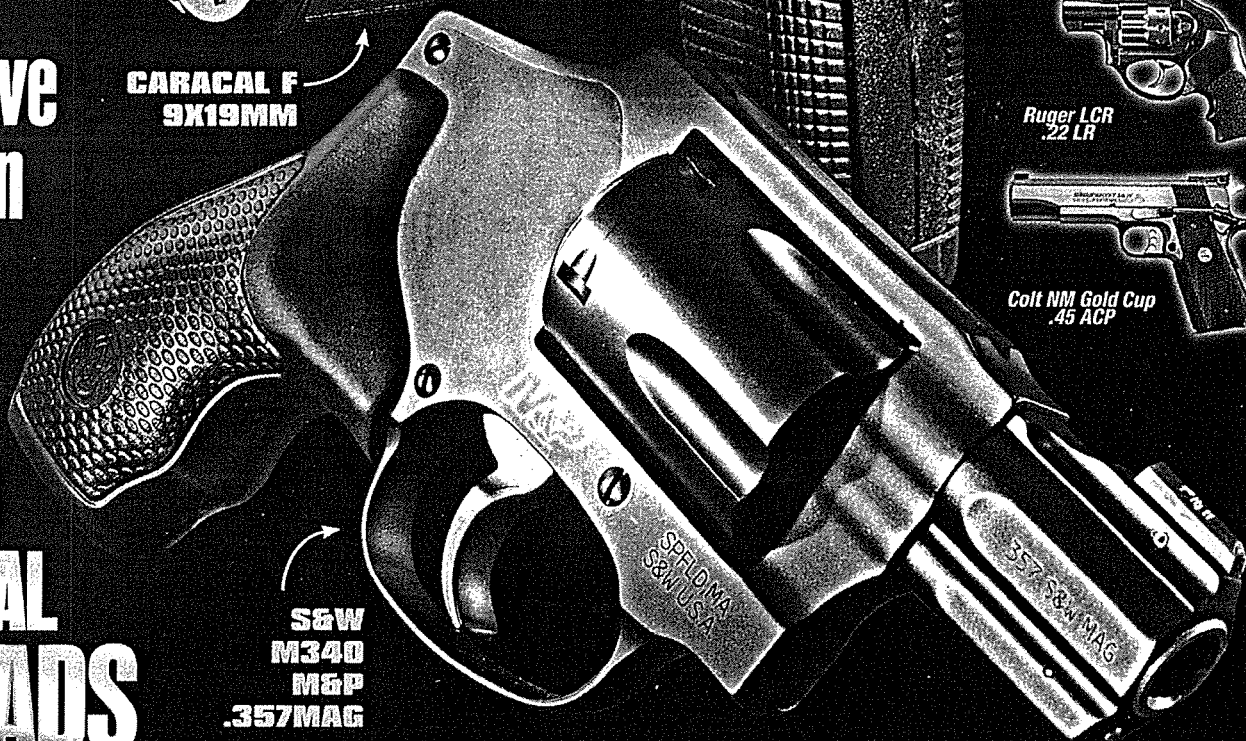
S&W M340 M&P .357MAG

AYOOB'S FAVORITE AUTOPISTOLS & REVOLVERS