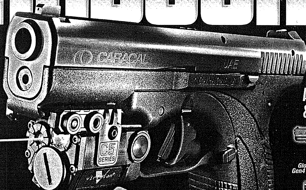
CARACAL F 9X19MM