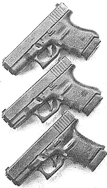
Glock offers different grip options. Among these G30 .45s (starting from the top) we have a standard G30, a G30 SF, and an early G30 with a grip trim from Rick Devoid.

By the turn of the 21st century, Glock had come out with guns in a length between standard and target length, their barrels 5.3 inches long and specifically engineered to fit the "footprint" of maximum sizes mandated for two of America's most popular action shooting sports. Called the "Tactical/Practical" Glocks, the Glock 34 in 9mm took G17