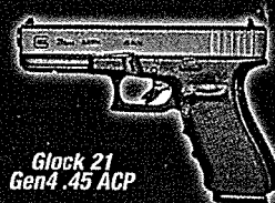
Glock 21 Gen4 .45 ACP

AYOOB'S FAVORITE AUTOPISTOLS & REVOLVERS