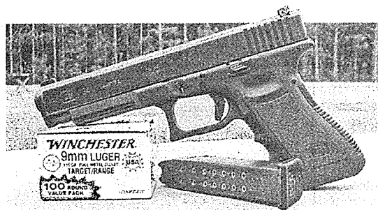
The Glock Tactical/Practical, here in a 9mm G34 configuration.

Glock has been known to produce other calibers for markets outside the United States. The Glock in caliber 9x21 is popular in Italy, where private citizens are forbidden to own military caliber guns. One South American nation reportedly permits its citizens to carry only .32 or smaller caliber handguns; a Glock in .30 Luger would be ideal there. Glock produces compact and subcompact