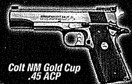
Colt NM Gold Cup .45 ACP