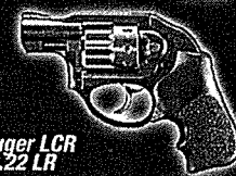
Ruger LCR .22 LR