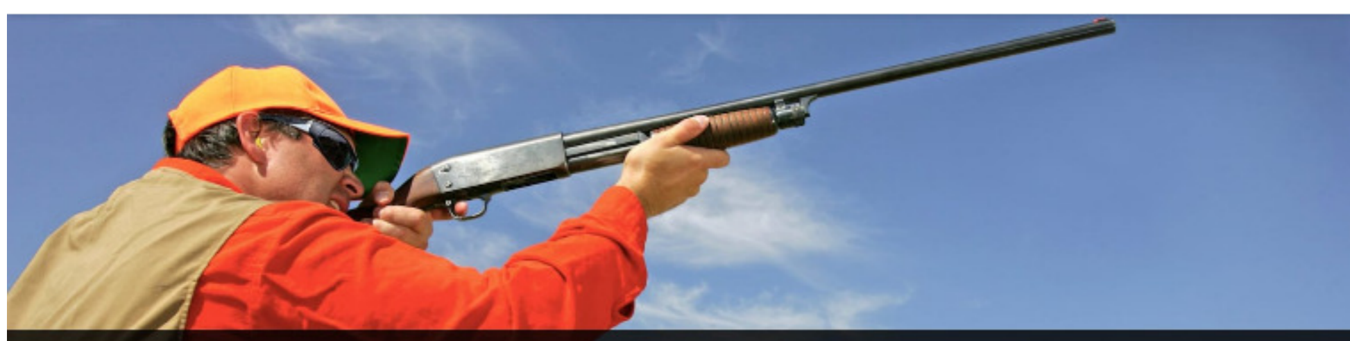
Trap / Bunker Ranges Learn more