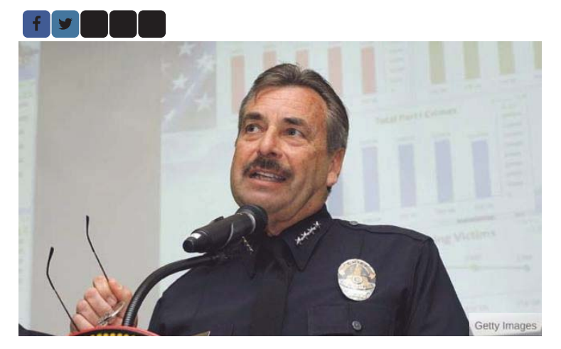
LOS ANGELES, CA - JANUARY 6: Los Angeles Police Chief Charlie Beck announces the 2009 crime statistics for Los Angeles on January 6, 2010 in Los Angeles, California. The city is reporting its lowest crime rate in about 50 years with a violent crimes falling 10.8 percent and property crimes down 8 percent compared to 2008.

"There is no reason that a peaceful society based on rule of law needs its citizenry armed with 30-round magazines"