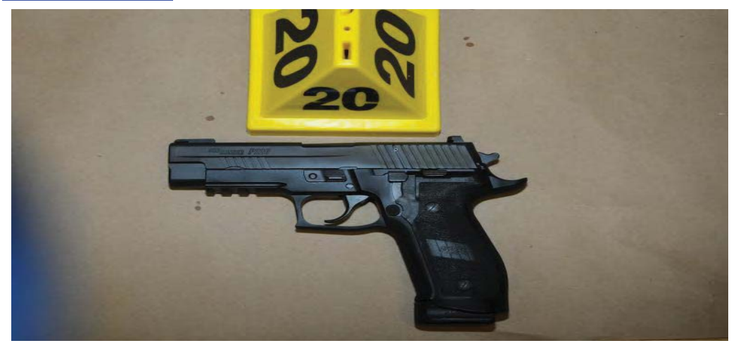
Exhibit 28 Page 01287