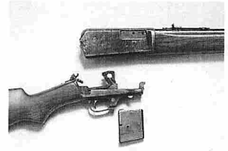
Winchester SL 05 Take Down

The Vintage Semi-Automatic Sporting Rifles Forum - Winchester Model 1905 - http://vintagesemiarifle.proboards105.com/index.cgi?board=wino5