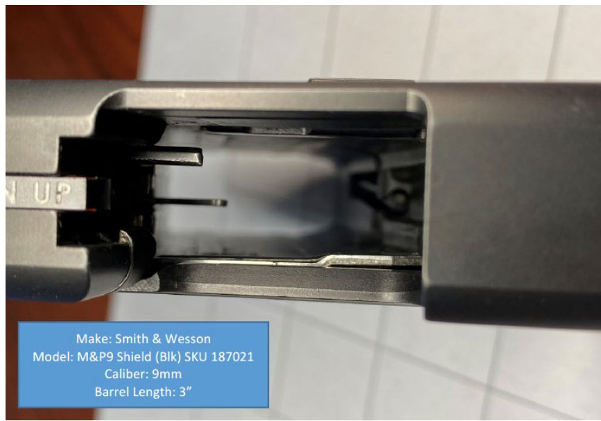
Figure 3. An MDM on the Smith & Wesson M&P9 Shield.

When the magazine is inserted up through a gun's grip and properly seated, it pushes the MDM lever up towards the back of the firearm, which allows the user to fire a round. See, e.g., Figure 4 (Boland ER, 6-ER-1241).