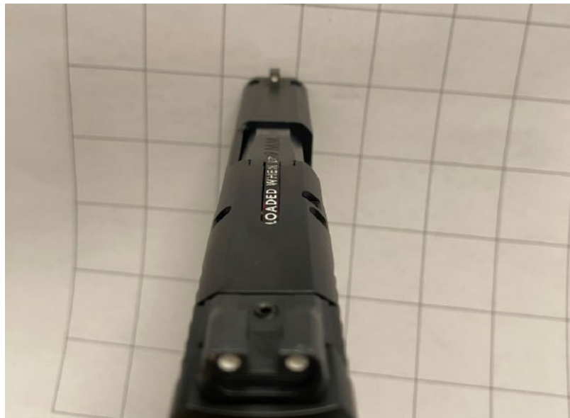
Figure 2. ( Boland ER, 6-ER-1239).

This is the view from the shooter’s perspective: