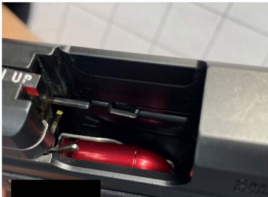
Figure 4. A raised MDM on the Smith & Wesson M&P9 Shield.

A magazine disconnect mechanism is thus a commonsense safety feature that prevents a gun with a detachable magazine from firing when the magazine is out of the gun. Many people incorrectly assume that a gun is unloaded if the magazine has been removed or is not fully inserted. 32 But crucially, there may still be a round in the chamber ready to be fired, even if the magazine is not in the gun. “Without an