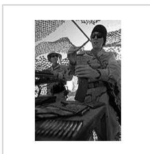
Loading a magazine with an alternative style of loading tool.