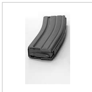
USGI Enhanced Performance Magazine (EPM) for AR-type rifles [14]