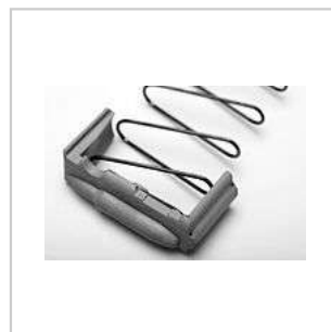
Improved M16 magazine follower