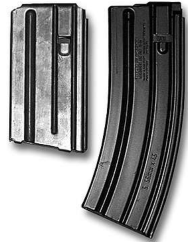
Two STANAG-compliant magazines: A 20-round Colt-manufactured magazine, and a 30-round Heckler & Koch "High Reliability" magazine.

A STANAG magazine [1][2] or NATO magazine is a type of detachable firearm magazine proposed by NATO in October 1980. [3] Shortly after NATO's acceptance of the 5.56×45mm NATO rifle cartridge , Draft Standardization Agreement (STANAG) 4179 was proposed in order to allow NATO members to easily share rifle ammunition and magazines down to the individual soldier level. The U.S. M16 rifle 's magazine proportions were proposed for standardization. Many NATO members, but not all, subsequently developed or purchased rifles with the ability to accept this type of magazine. However, the standard was never ratified and remains a "Draft STANAG". [4]