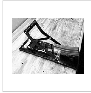
Trijent Mech-loader for high volume loading