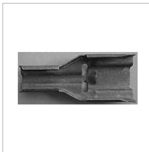
Close-up of STANAG guide tool.