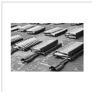
STANAG guide tools and stripper clip filled with 5.56mm NATO ammo.