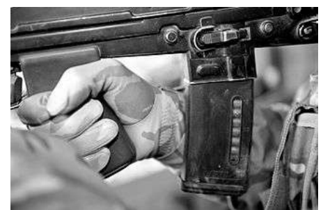
Close-up of L85A2 with Magpul Industries EMAG polymer magazine with clear viewing window

The STANAG magazine, while relatively compact compared to other types of 5.56×45mm NATO box magazines , has often been criticized for a perceived lack of durability and a tendency to malfunction unless treated with a level of care that may not be practical under combat conditions. Because STANAG 4179 is only a dimensional standard, production quality from manufacturer to manufacturer is not uniform. Magazines have been manufactured with lightweight aluminum or plastic bodies and other inexpensive materials in order to keep costs down, or to meet requirements that treat the magazine more as a disposable piece of equipment than one that is supposed to stand up to repeated combat use.