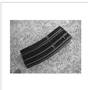
T91 30-round STANAG-compliant magazine with ammo capacity indicator.