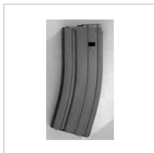
Standard issue 30-round M16 magazine.