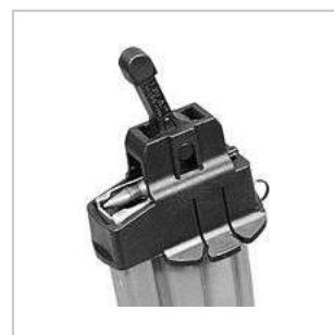
M-16 / AR-15 LULA magazine loader and unloader.