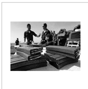
Loaded STANAG magazines