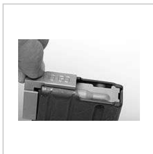
The Feed Lips Wear Tool is designed for inspecting STANAG magazines