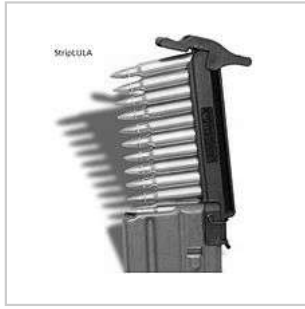
StripLULA™ loading tool.