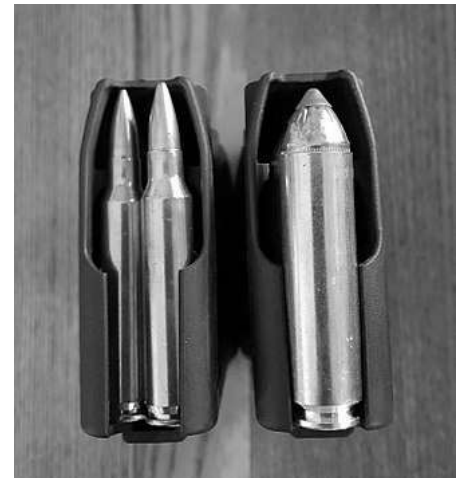
STANAG magazines loaded with .223 Rem (left) and .450 Bushmaster (right)