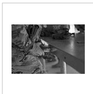
Ditto, with stripper clip pressed against a hard surface to load the magazine more quickly.