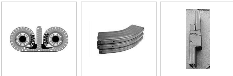
Diagram of a In order to comply Two STANAG 30- STANAG Beta C with civilian legal round magazines magazine restrictions. placed together with duct tape in the magazines may be "Jungle style". pinned to hold only 5 rounds.