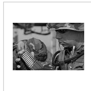
Loading a magazine with STANAG stripper clip and guide tool.