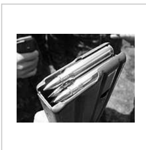
Close-up of loaded STANAG magazine