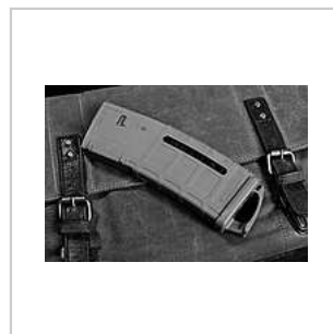
STANAG-compliant 30-round PMAG with Ranger Plate from Magpul Industries. Note: clear viewing window.