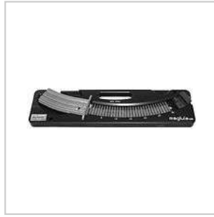
BenchLoader heavy-duty magazine loader.