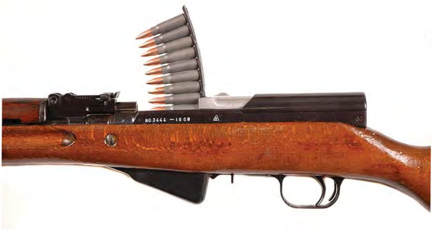
Romanian SKS carbines were imported into the U.S. during 2002. The factory symbol is an arrow inside of a triangle, similar to the Russian Izhmash logo, except the Romanian arrow has no fletching (feathers). The SKS was designed to be loaded by stripper clips. A stripper clip guide

This website uses cookies. By continuing to use this website you are giving consent to cookies being used. Visit our Privacy and Cookie Policy .