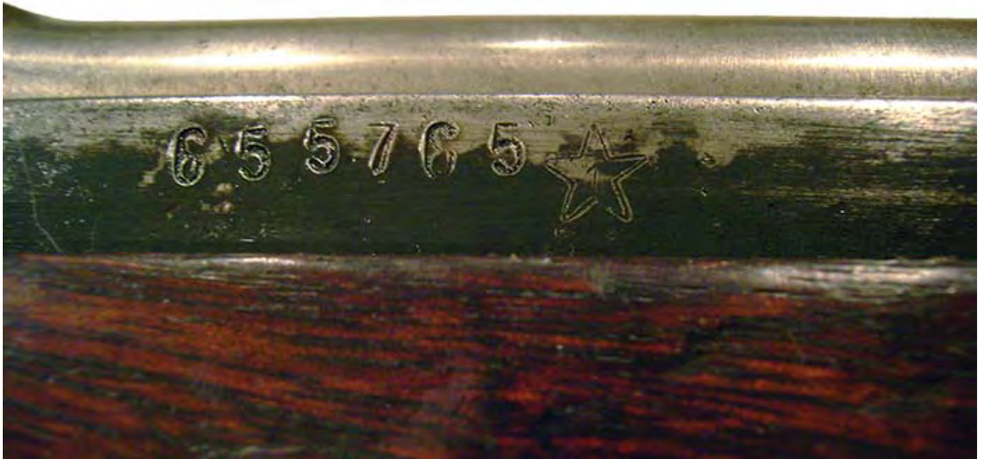
Identifying markings on North Vietnamese SKS carbines are a number 1 inside of a star.