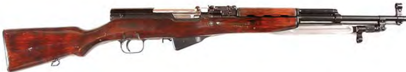
A Russian made SKS, the semiautomatic 7.62x39mm carbines were manufactured in the Soviet Union from 1949 to 1956. (Private collection)

During 1941, Simonov submitted two more carbines designs, one of which passed initial testing and fifty more were ordered for field trials. However, on the 22nd of June, 1941, the Germans launched a massive invasion in an attempt to conquer the Soviet Union. As the Wehrmacht advanced, many factories had to be abandoned, delaying further progress on Simonov's carbine until 1944. When work was finally resumed the carbine was re-chambered for the original mid-range 7.62x41mm cartridge (later changed to 7.62x39mm). The Simonov carbine was basically similar to his 1941 design, with only a few minor changes. The first Simonov carbines were shipped to Soviet troops on the Byelorussian front and to the Vistrel officer-training school. Initial reports stated that the carbine was easily reloaded, light and maneuverable, but there were also problems with sensitivity to dust, jams and failures to eject. Despite the problems, the trials commission recommended that Simonov continue to improve his carbine. During 1949 Simonov's improved design was officially adopted as the 7.62 Simonov self-loading carbine, Model 1945 or SKS-45.