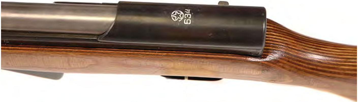
The identifying markings on the North Korean Type 63 are on top of the receiver cover.

odel 59/66 that has a permanently attached NATO spec 22mm diameter grenade launcher, gas cut off valve and flip up grenade sight. The attachment of the launcher tube to the barrel added 3.74 inches (95mm) to the weapon's overall length. There are several variations of the grenade launcher tube configuration. Later tritium and/or phosphorus night sights were added and this variation is often referred to as the 59/66A1. The Yugoslavian SKS variants do not have chrome-lined barrels and chambers because the technology to apply it wasn't available in that country during production. Manufacture of the 59/66 started in 1966 and lasted until 1970. A large number of the Yugo 59/66 rifles have been imported, many in new or like new condition. During 2003 the Yugo SKS carbines were advertised for as low as $89.