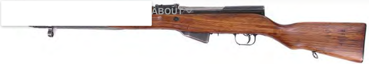
Yugoslavia Type 59, without the permanent grenade launcher, the predecessor to the more common 59/66 model.