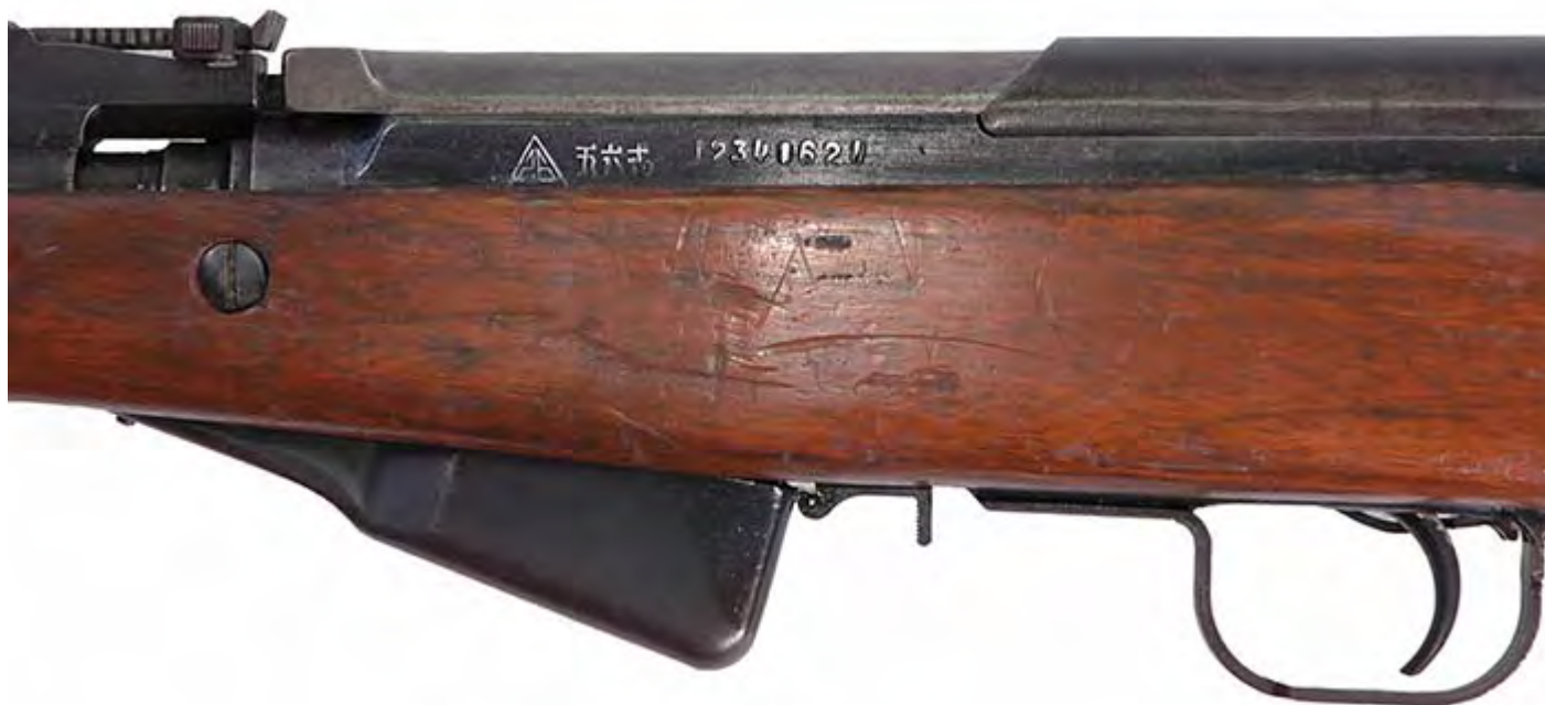
The Chinese made SKS carbines were in production longer than any other country; most were manufactured at Arsenal 26. The Chinese characters represent i56 type.î (MOD Infantry and Small Arms School collection, Warminster, England)

numbers of the Albanian SKS carbines and stores of 7.62x39mm ammunition were destroyed by [REDACTED] after the Balkan wars. Several NATO countries, including the United States and Great Britain, supplied funding for the destruction project. Only a limited number of Albanian SKS rifles were imported during 2002, the average price was $229.