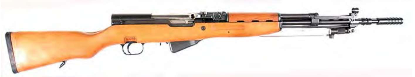
Yugoslavia 59/66 grenade launching model. Many of this variation have been imported in excellent to new condition.

This article first appeared in Small Arms Review V17N4 (December 2013)