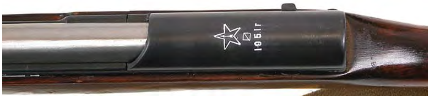
A 1951 Russian SKS manufactured at the Tula Arsenal. Note the presence of the box with a diagonal line symbol designating that this carbine has undergone a refurbishing process. The Tula symbol is an arrow inside of a star.

The SKS is a gas operated, semiautomatic-only carbine that has a fixed 10-round magazine that is designed to be loaded through the top of the receiver using stripper clips. The Soviet SKS weighs approximately 8.8-pounds with an overall length of 40.16 inches, which is somewhat heavy and long for its midrange round. The rear sight is calibrated for a range of 100 to 1,000 meters, with a 300 meter battle sight position. The action's locking mechanism is a tilting-bolt design.