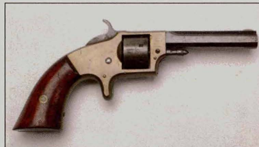
NATIONAL FIREARMS MUSEUM

Enter a young gunsmith named Rollin White, born in 1818, who went to work in Sam Colt's revolver factory in 1849. White was also an inventive tinkerer. Loyal to Colt, he even paid the factory $18.50 in 1852 for a revolver to experiment with in order to create a workable cartridge revolver. And then he quit the Colt factory in December 1854.