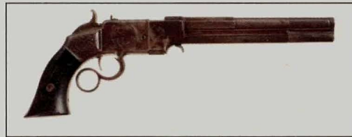
ROCK ISLAND AUCTION CO.

and Europe to develop what was called the "self-contained cartridge"—a metal "sleeve" that could be loaded into the open breech of a gun with the powder, ball and ignition source already sealed inside the sleeve for instant loading and firing. But the metal sleeve would take several years of experimentation and failure before it would become the common cartridge of today.